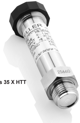
Series 35 X HTT