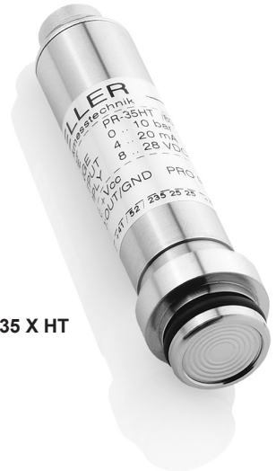
Series 35 X HT