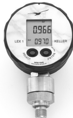
LEX 1 with piezo-resistive pressure sensor