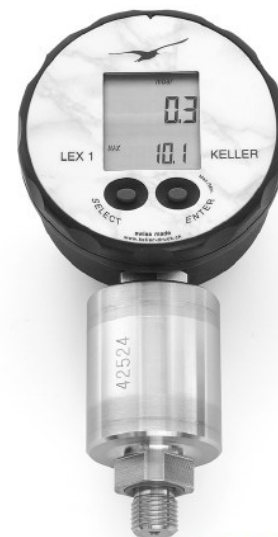
LEX 1 with capacitive pressure sensor