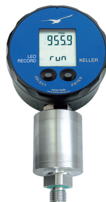
LEO Record Ei with capacitive sensor