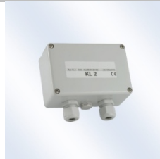
Cable Terminal Box with Vent Part No. KL2-ZB.601-200-000-4