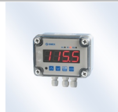
Wall mounted digital indicator Part No. SRP-N118-1821-1-2-001