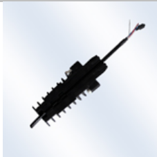
Cable support hanger Part No. 100084