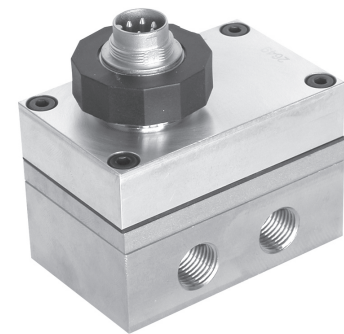
Medium Pressure Version