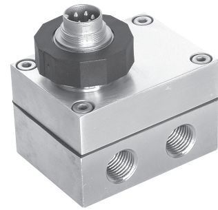
Low Pressure Version

The analog output is freely scalable via the interface. For flow measurements, the root of the differential pressure can also be outputted. The calculated value can be outputted via an analog interface (0...10 V or 4...20 mA).